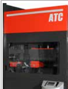
Automatic Tool Changer